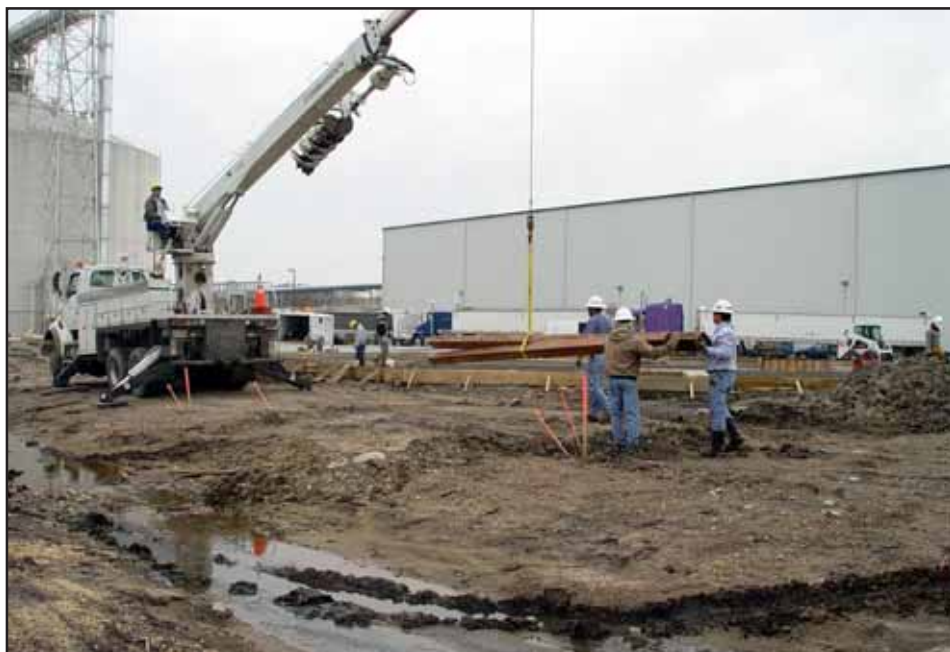
NIPCO crews, in foreground, work on relocating a line that crosses the Amaizing Energy property while the ethanol plant's construction crews, in background, build new grain storage bins.

Another new substation, Pleasant Substation, will be located in Pottawattamie County and will serve a planned warehouse and manufacturing business. Site selection is underway. ❖