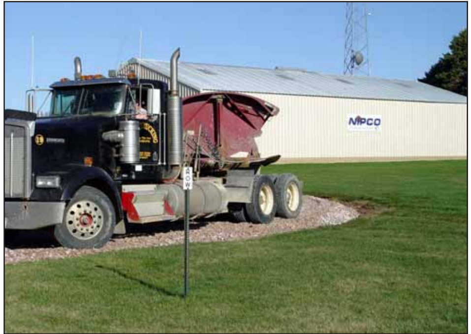
A truck delivers one of several loads of rock for a new temporary access road to NIPCO through the Iowa Department of Transportation right of way. The relocation of Highways 75/60 closed NIPCO's driveway off County Road C-38.

The same storm caused outages at two other NIPCO substations. Later that evening, crews secured a cracked pole near Remsen. The outage lasted less than a minute. At Schleswig, a lineman had to manually untangle a power line. Service was restored after one hour, 13 minutes. ❖