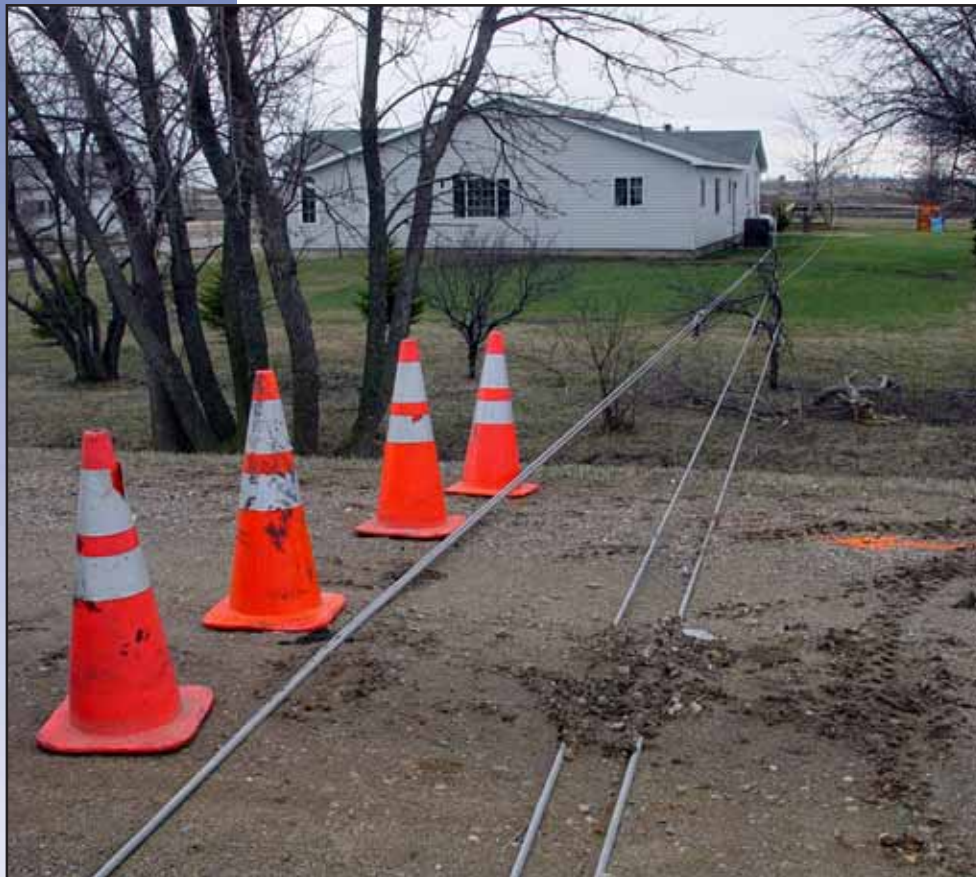
A strong spring storm took out 18 NIPCO transmission poles along 220th and 240th streets southeast of Sergeant Bluff in Woodbury County March 30. While the poles went down, neither the conductor nor the fiber optic cable broke.

the following day when NIPCO crews installed two temporary poles on either side of 240 th Street to get the conductor off the road. The Bronson Fire Department, Woodbury County Sheriff's Office and Woodbury County Highway Department all aided in traffic control. The crews set new poles the following