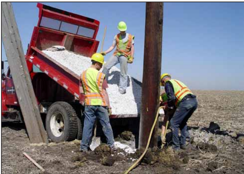
A construction crew from Embloms Midwest in Sauk Centre, Minn., sets a pole for the Covey tap line rebuild in O'Brien County during April.

The 2006 construction season is well underway across the NIPCO system. Southern Substation, a new facility, will serve an expanding meat processing plant at Oakland. It is expected to be energized this summer. Construction of the 10 MVA sub started in the summer of 2005. A quarter-mile tap line will be built this summer to provide power to the sub.