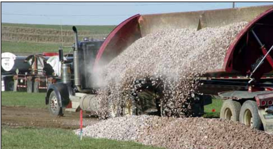
Rock pours out of a trailer to create a temporary access road to NIPCO.

The change is due to highway construction. The southernmost segment of the Highway 75/60 bypass project crosses NIPCO's front yard. The Iowa Department of Transportation purchased a portion of NIPCO's property to move the highway to the west. Landscaping and NIPCO's lighted sign have been removed. Construction is expected to last several months. When the project is completed, NIPCO will again have a driveway opening on County Road C-38 to the north. The relocated highway will be closer to NIPCO's building. A retaining wall will separate NIPCO's east parking area and the highway. ❖